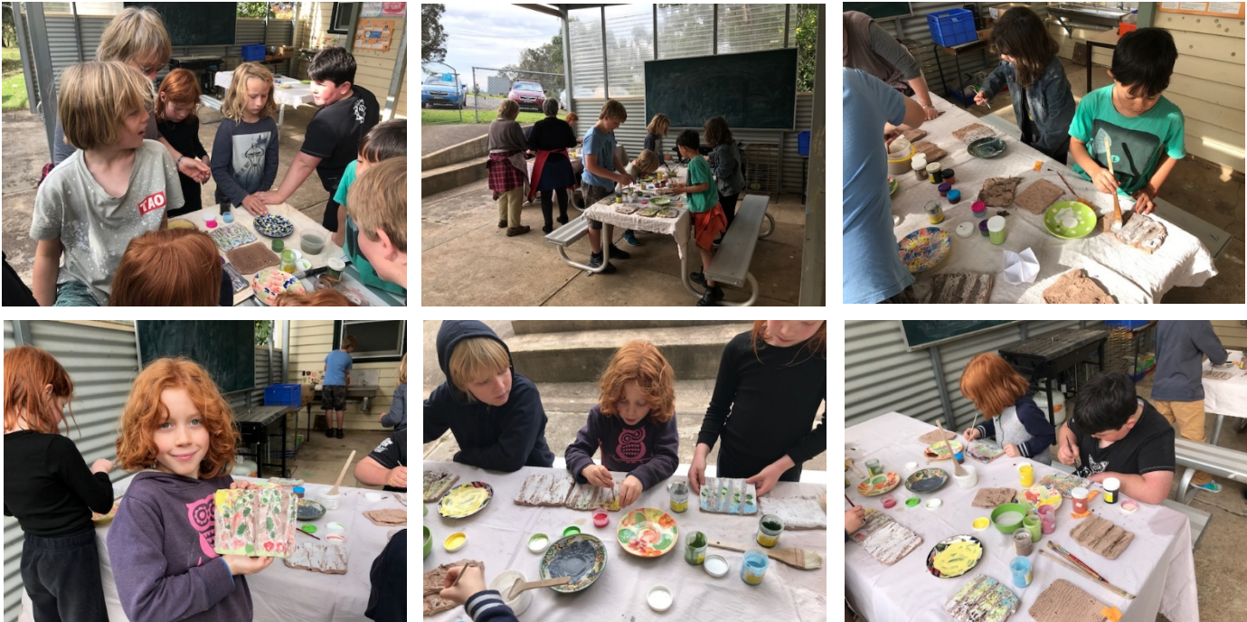
Fun with pattern blocks in the morning